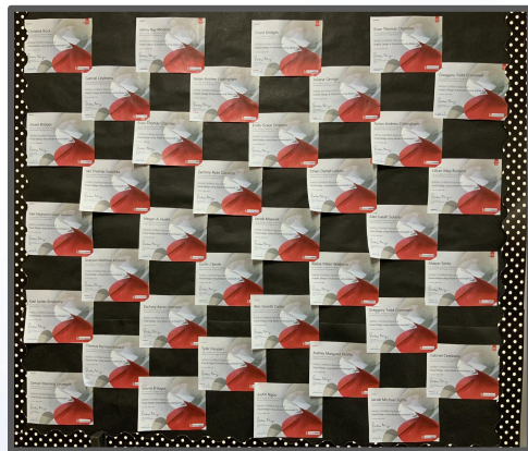
Adobe Certifications earned by students.

Dual Enrollment offered at select campuses