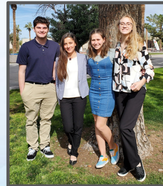
Students demonstrate professionalism and work effort as they compete at SkillsUSA.