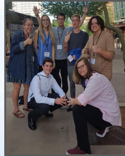
Students attending SkillsUSA Fall Leadership Conference, Oct 2018